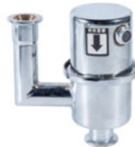
Vacuum Inlet Dust Filter