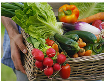
GARDEN & DRCHARD