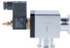
Vacuum Solenoid Valve