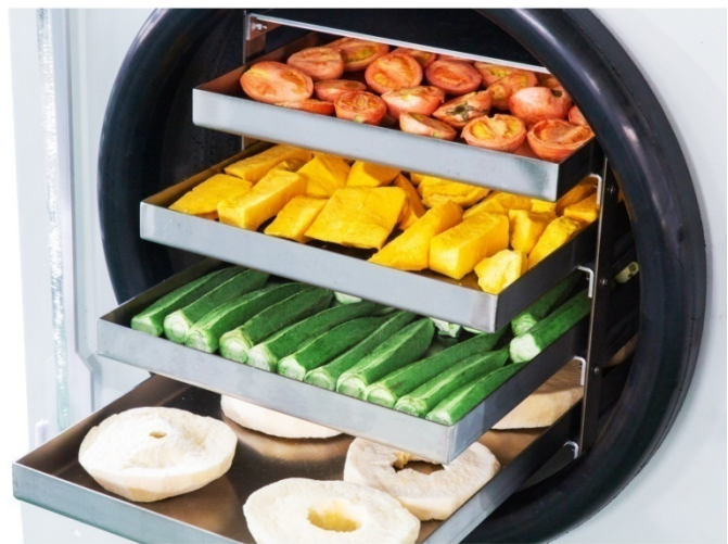
After Freeze Drying