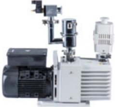
Pump Optional Accessories