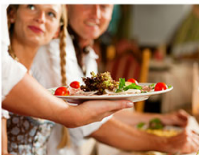
SNACK BAR & FOOD SHOP