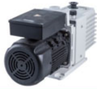
Premium Vacuum Pump MegaMax-6