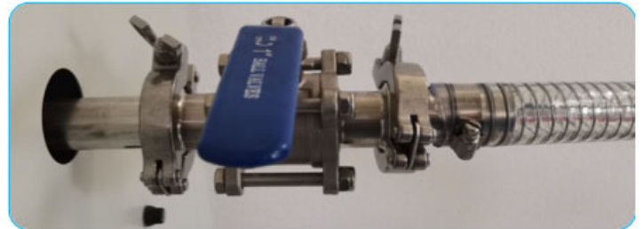
Manual Ball Valve (Close)