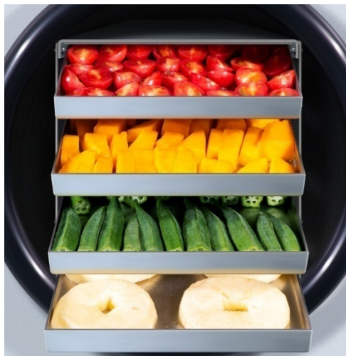
Before Freeze Drying

You can freeze dry avocados! They're just as perfect as when they were fresh. This is a game changer, considering how quickly avocados ripen and spoil! And, rehydrated they make the perfect guacamole.