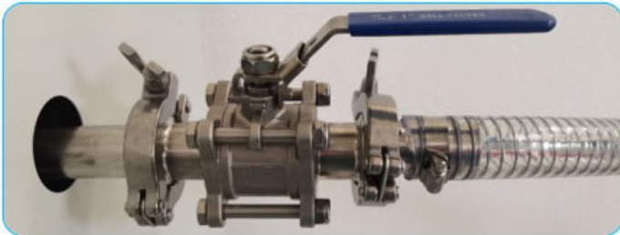
Manual Ball Valve (Open)