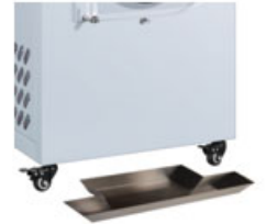
SUS304 Drip Tray