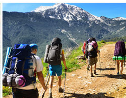
CAMPING & HUNTING