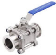
Manual Ball Valve