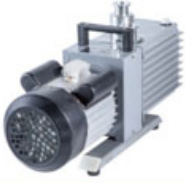
Standard Vacuum Pump 2XZ-4