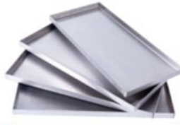
SUS304 Tray (Spare Use)